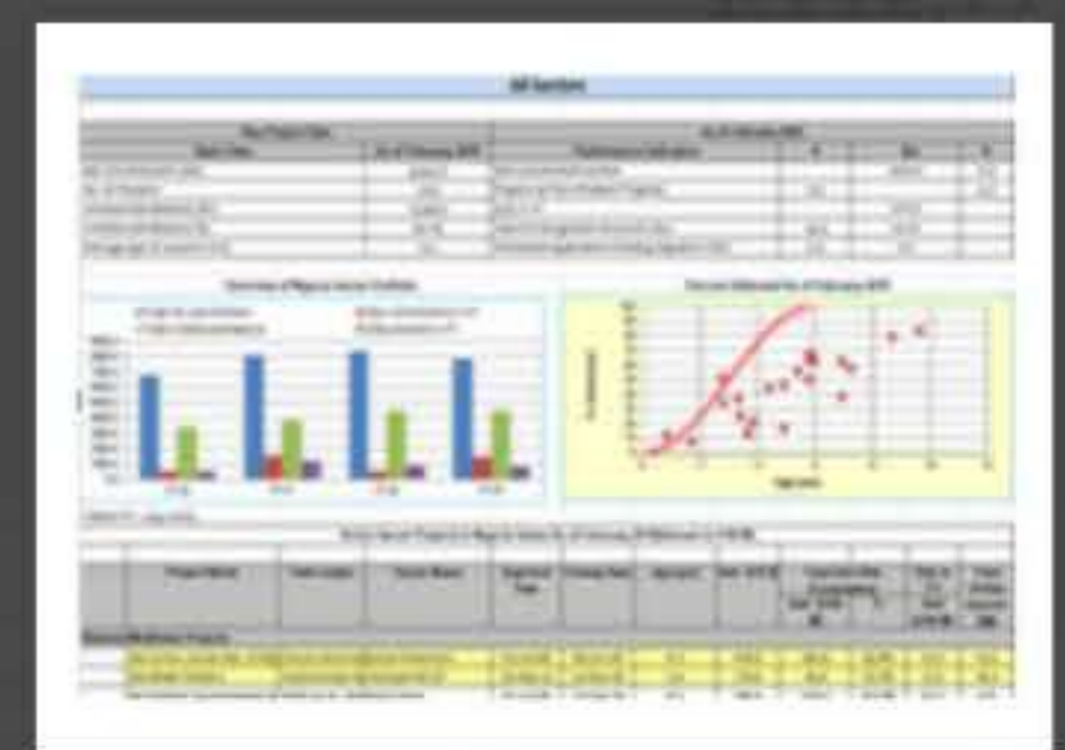
Report Module generates reports in excel and graphs representing complex data.

The tool serves as a powerful presentation platform, used by the head of the organization to present progress to various state heads.