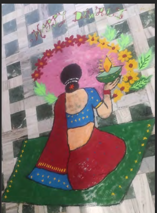
"A Reel to the Virtual World..."